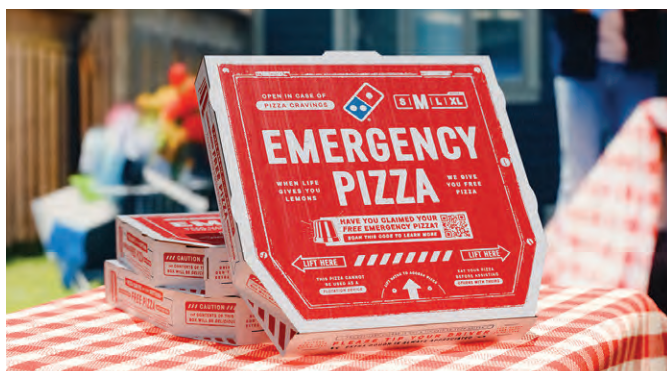
Emergency Pizza was back in 2024 in more places than ever.

We leaned into consumer tensions and created talk value in our national promotions. At a time where consumers are feeling they are getting less and paying more – our MORE-flation campaign showed them Domino's was in their corner – giving them more for less. Another area where we broke through the clutter in 2024 was around the growing pressure to tip, even when no extra service is provided. We decided to flip the script by tipping customers back through our You Tip, We Tip promotion. Finally, we brought our Emergency Pizza campaign back, but in more places than ever. We partnered with Amazon's Twitch, Netflix's Squid Games, NFL star Stefon Diggs, and the beauty brand Olive & June to bring Emergency Pizza to consumers in fun and unexpected ways.