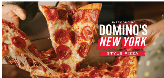
Domino's launched New York Style Pizza, reflecting our commitment to having the Most Delicious Food.

New York Style Pizza added a popular crust option to our menu, while Mac & Cheese reinvigorated our existing pasta platform. As we head into 2025, we will continue to build on this momentum by focusing on making our innovation more ownable and memorable through the launch of at least two new products – which is our annual goal.