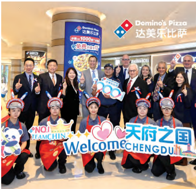
We celebrated the opening of the 1,000th store in China in Chengdu.