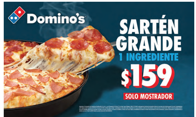
Mexico and our other international markets successfully leaned into Renowned Value in their promotions.

Despite geopolitical challenges and economic pressures, our international franchisees have shown remarkable resilience and have enormous potential for growth. By focusing on driving our Hungry for MORE strategy, we expect to create sales momentum that will produce the same kind of market share gains and net store growth we have achieved in the past.