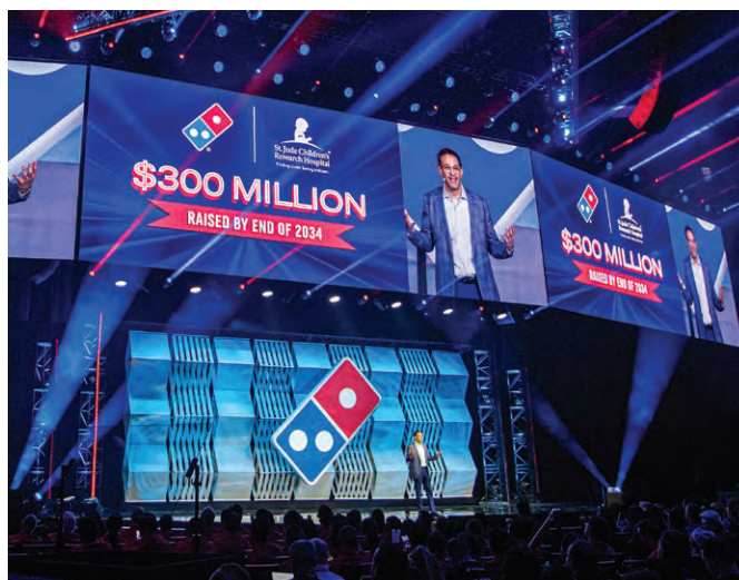
Domino's committed to raising $300 million for St. Jude Children's Research Hospital, the largest commitment to a children's hospital ever made.

In the U.S., St. Jude Children's Research Hospital™ is our national charity partner, and for 20 years we have supported this lifesaving organization, raising over $143 million in customer donations since 2004, and joining them in their mission to find cures and save children around the world. At Rally this year, I announced Domino's commitment to raising $300 million for St. Jude by 2034 . No brand has ever made a commitment like this to a children's hospital, and I am proud to say that in 2024 we raised $18 million, already exceeding our annual target on the road to a cumulative $300 million.