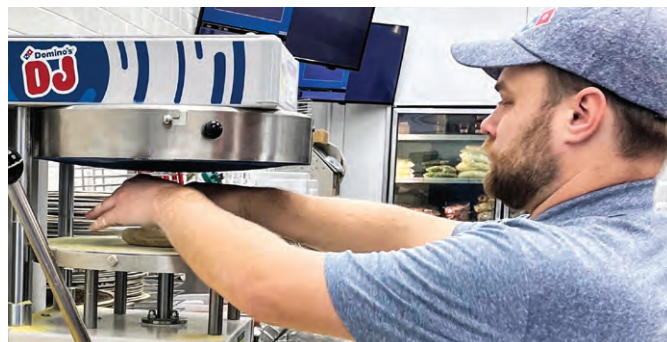
Domino's 'DJ' dough stretching machines are having an impact on product consistency and speed to competency for new team members.

Additionally, we also made significant progress in deploying 1,600 'DJ' dough stretchers (appropriately named DJ, for the way it 'spins' dough) across our U.S. system – more than a 50% increase from where we were at the end of Q3. All these investments ensure that every Domino's customer receives a consistent, high-quality experience. They also make the job easier for current team members and speed up the time to competency for new employees. I want to thank our franchisees and our operations team for their continued efforts to achieve Operational Excellence. This is a point of pride and differentiation for Domino's.