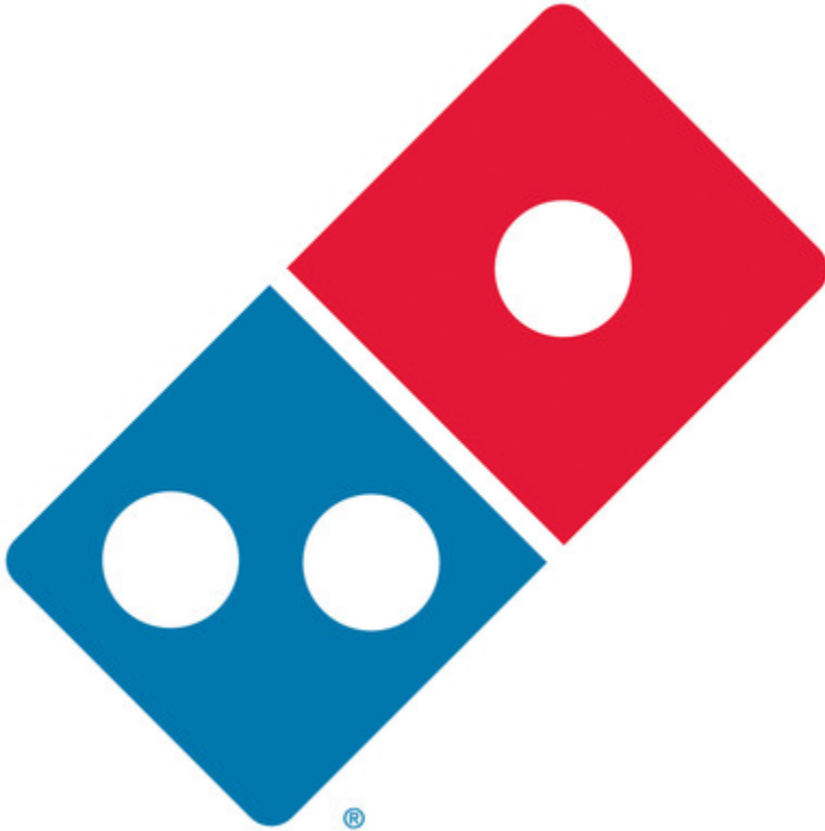
Photo - http://photos.prnewswire.com/prnh/20150612/222806 Logo - http://photos.prnewswire.com/prnh/20120814/DE55948LOGO-b

Order - www.dominos.com Mobile - http://mobile.dominos.com Digital Info - anyware.dominos.com Company Info - biz.dominos.com Twitter - http://twitter.com/dominos Facebook - http://www.facebook.com/dominos YouTube - http://www.youtube.com/dominos