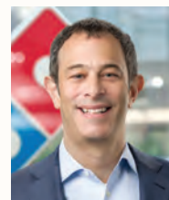
Russell Weiner Chief Executive Officer

We marked our 65th anniversary in 2025 and still have so much more ahead of us. Our growth prospects have never been greater because our brand has never been stronger. Domino's has always been in the business of creating our own tailwinds and driving growth. That has been, and will continue to be, how we drive best-in-class results and long-term value creation for our franchisees and shareholders. Together, we are Hungry for MORE.